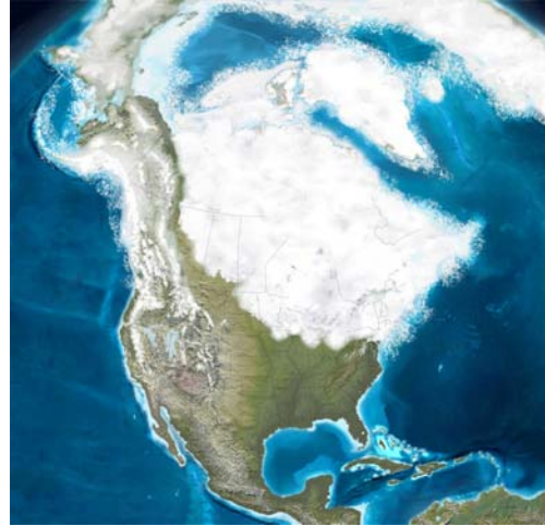
2.6 M yrs ago

2) Sea level is rising faster today than in the 1960's