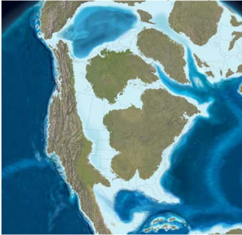
75 M yrs ago

1) Sea level has been fluctuating throughout geologic time